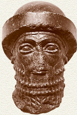
Hammurabi ? –1750 B.C.

The noted lawgiver Hammurabi was also an able military leader, diplomat, and administrator of a vast empire. Hammurabi himself described some of his accomplishments: