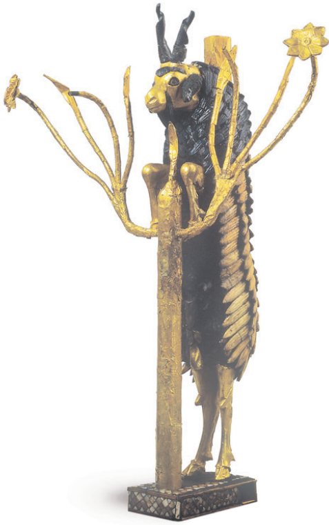
▲ This gold and lapis ram with a shell fleece was found in a royal burial tomb.

Sumerians built impressive ziggurats for them and offered rich sacrifices of animals, food, and wine.